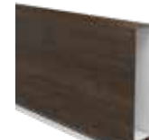
50 x 220mm Batten