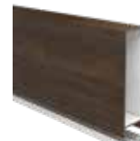
50 x 170mm Batten